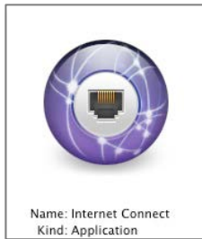
Figure 1: Internet connection

You should have been given a username and password to use by your System Administrator. The username will end with the .vpn extension. Please contact your System Administrator if you have not received or have lost your username and password.