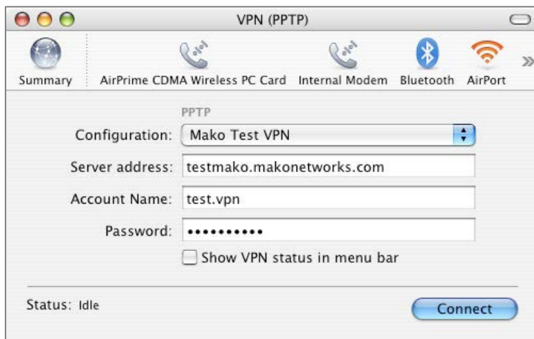
Figure 2: Internet connect

Open Internet Connect from your Applications folder and select VPN (PPTP) from the top menu.